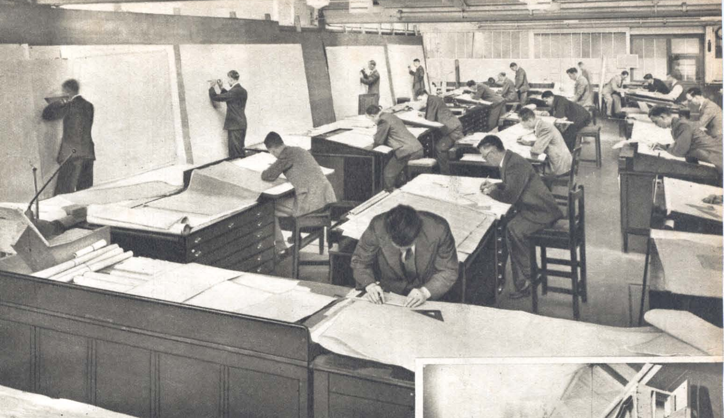
A section of the bodywork drawing office is seen above. Every minute detail is worked out here for those who make the great dies which are used to stamp out the steel panels. The picture on the right shows a special machine which "contours" the body dies: the tracer moving over the top pattern controls the movements of the cutter below.