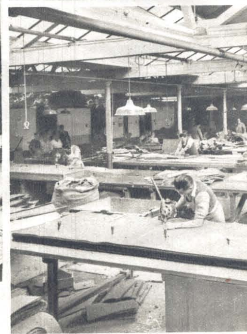
(Right) In the cutting-out room of the upholstery department.