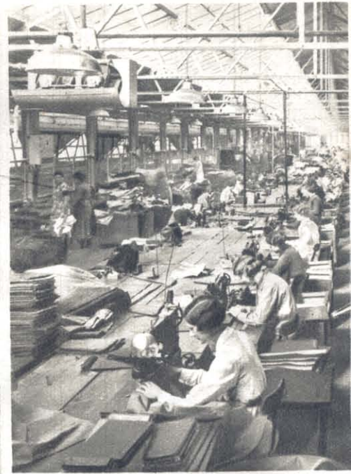
(Right) Part of the sewing room in the upholstery department.